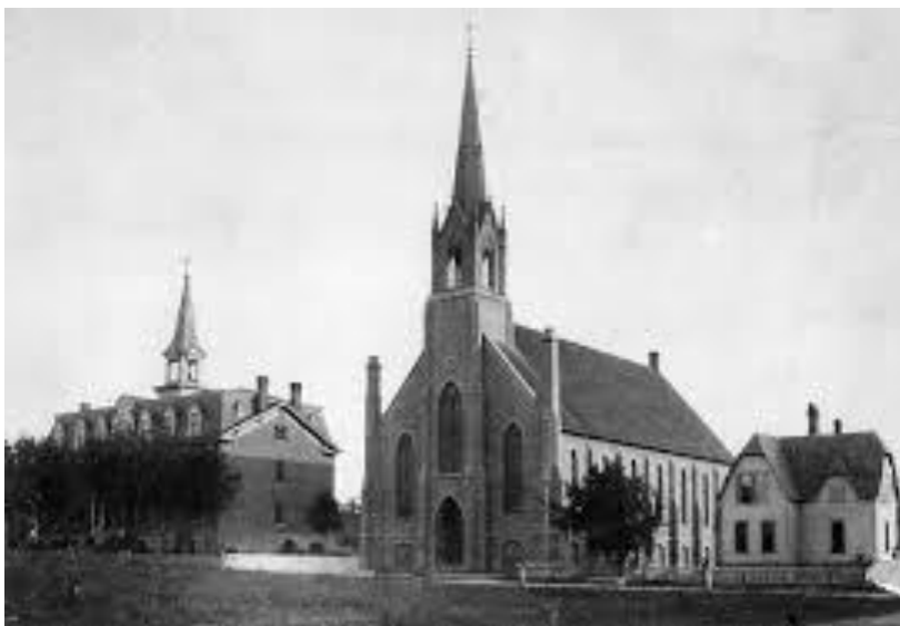
St. Rose of Lima Chapel 486 West Merchant Street Kankakee, Illinois